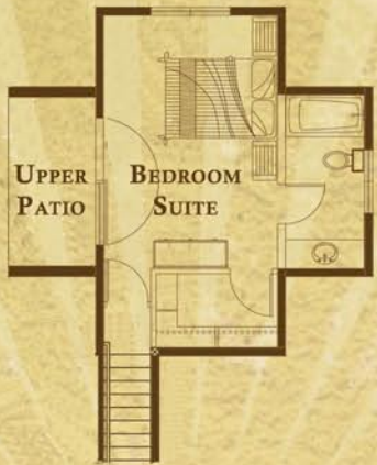
UPPER LEVEL OPTION "B" 430 SQ. FT.